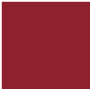
Ruby Red RAL 3003