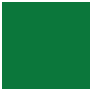
Grass Green RAL 6010