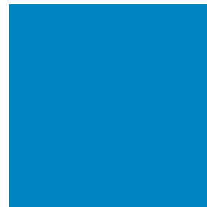
Skye Blue RAL 5015